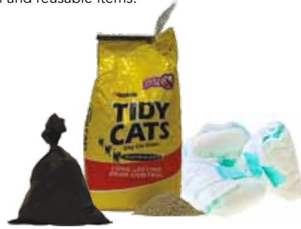
Diapers and Animal Waste