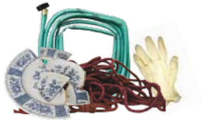
Unusable Ropes, Hoses, Broken Ceramics, Latex Gloves

NO: Hazardous Materials | Sharps | Recyclable Materials | Yard Trimmings | Dirt | Rock