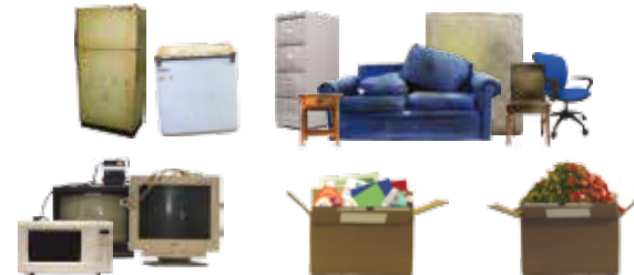
Appliances, Furniture, Electronics, Recyclables, Yard Trimmings

Tree trimmings and bundled branches cannot exceed 6 inches in diameter or be longer than 4 feet.