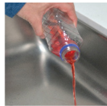
Pour out liquids.