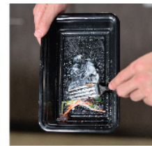
Scrape out food.