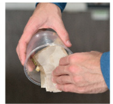
Wipe out oily or sticky residue.